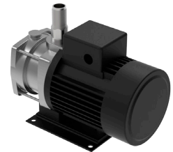
BUILT-IN TRANSFER PUMP • No external pump or wiring