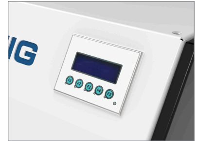
CONTROL INTERFACE • Set pressure & view filter life