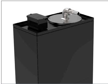
25 GALLON RESERVOIR • With built-in, 10-micron filter