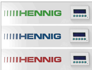
STATUS LIGHT • On (green) • Idle (blue) • Warning (red)