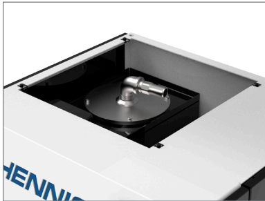
EASY ACCESS FILTER • 10-micron bag filter