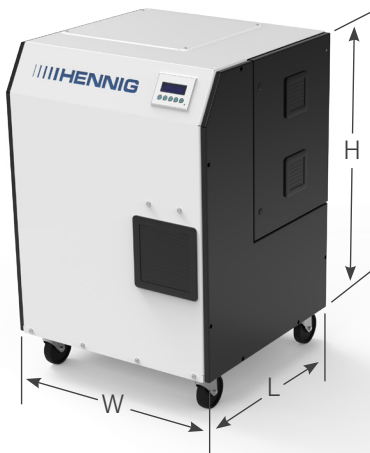
L: 25.5" (647.7 mm) W: 26.5" (673.1 mm) H: 37.5" (952.5 mm)